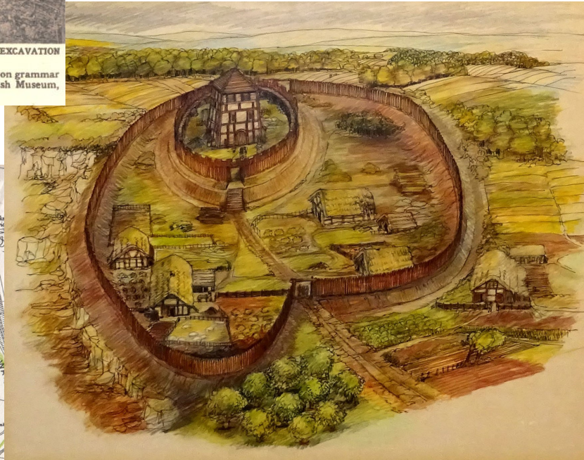
Artists impression of how the castle may have looked.