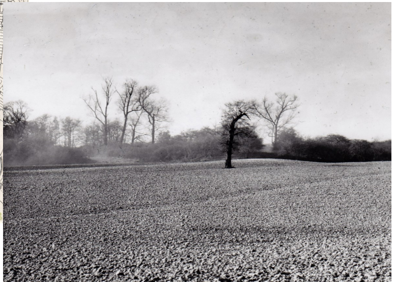
The castle site all that remains today