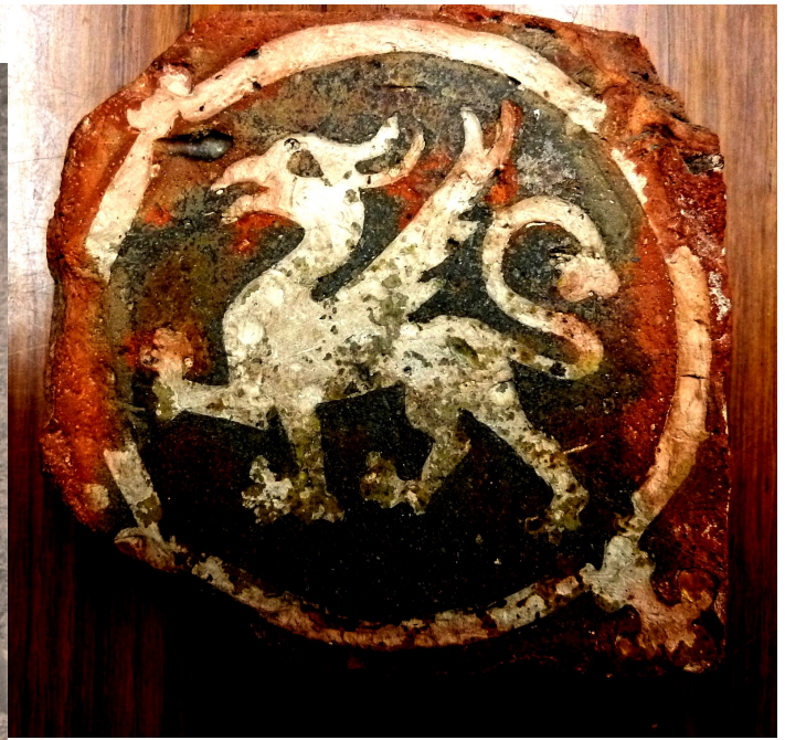
Part of decorated tile recovered in the 1960s